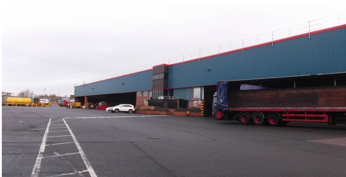
Warehouses tend to very large, undivided buildings

Additional hazards associated with specialist warehouses, such as automated high bay warehouses, cold stores, and premises used primarily for the storage of chemicals and other hazardous materials, are not specifically addressed in this Guideline. Additional guidance should be sought regarding these specialist storage premises, in addition to the material set out in this document.